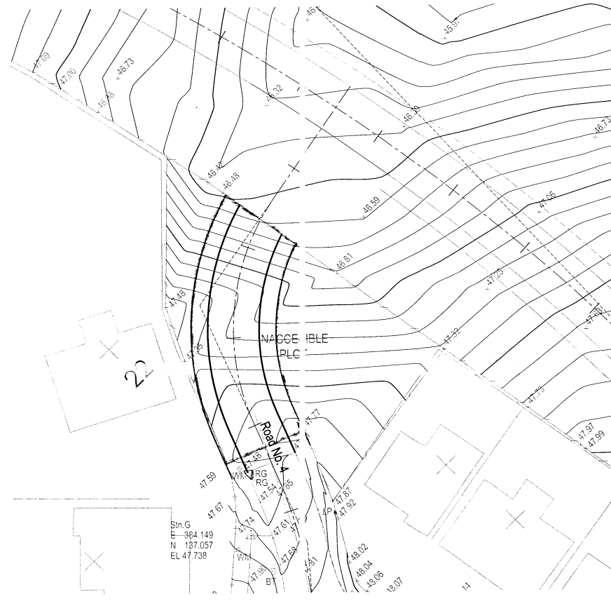
Junction with Nevem Crescent